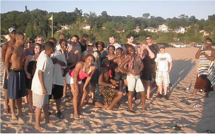
CM Summer Teen Club