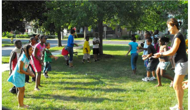
CM Summer Kids Club