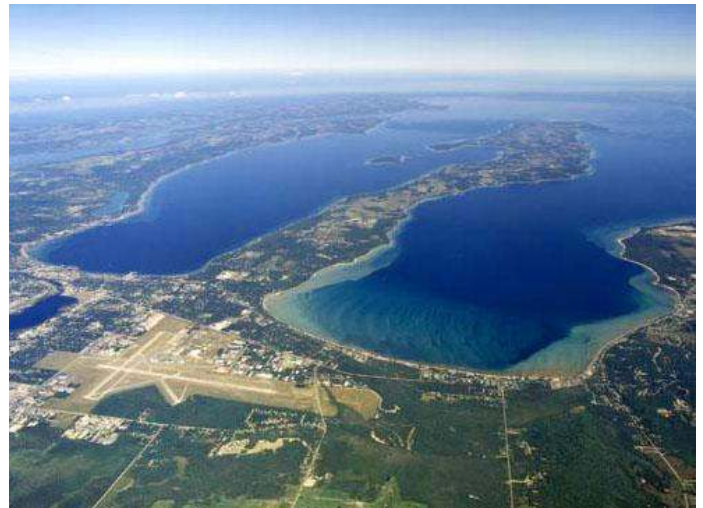
Traverse City, MI